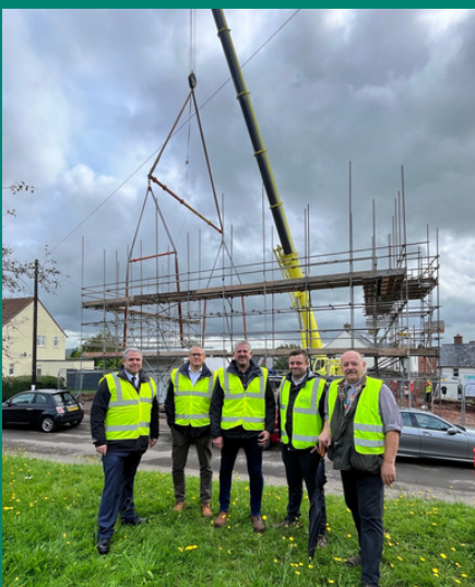
St Andrews Estate, Cullompton in September 2023 with the first delivery of the modular pods